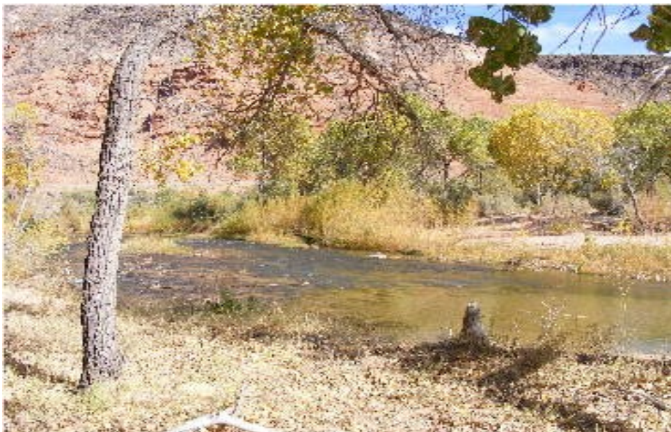
Virgin River Riparian Corridor

We began work with landowners in two exciting new project areas—the east entrance of Zion National Park, and in the riparian corridor downstream of the park. The scenic and ecological qualities of these parcels are outstanding and their protection will benefit our communities for generations to come.