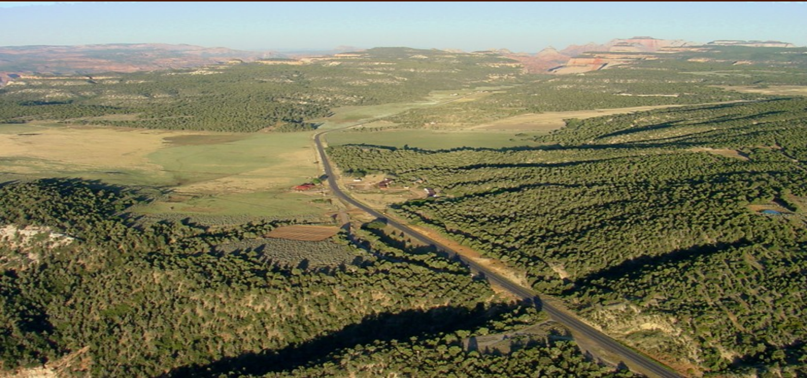
East Zion Entrance Corridor

We began work with landowners in two exciting new project areas—the east entrance of Zion National Park, and in the riparian corridor downstream of the park. The scenic and ecological qualities of these parcels are outstanding and their protection will benefit our communities for generations to come.